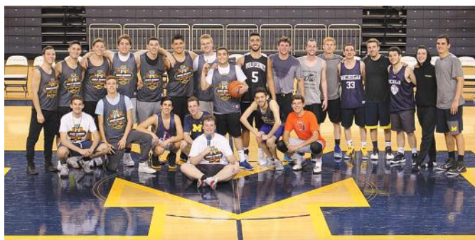
Marco Madness Fundraising Team