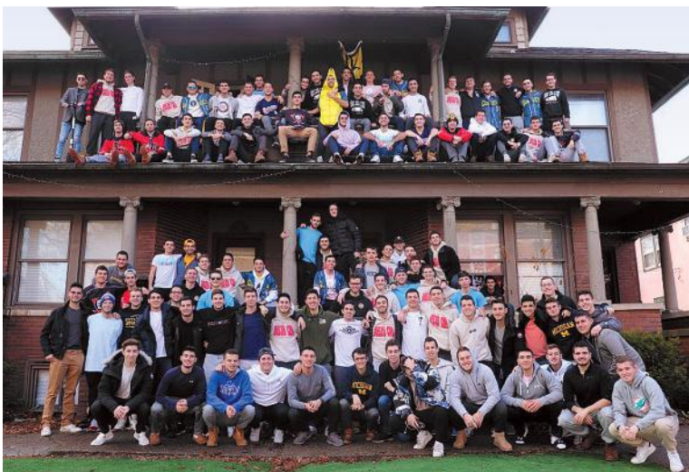
Entire DX Membership

Our social events remain strong and have helped students in greek life get through the challenges that accompany education