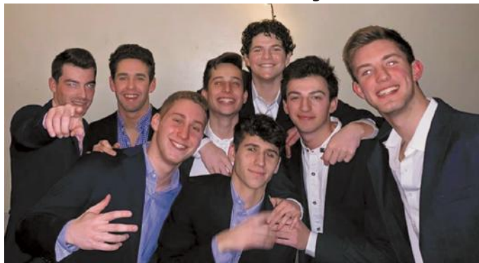
Winter Associate Members

in Ann Arbor. We have continued building upon our relations from the fall and have fostered strong ties with many of the sororities on campus. We continue to have events with these sororities despite our transition away from the University's IFC, to the newly founded Ann Arbor Interfraternity Council. Weekly AAIFC meetings have impressed upon me that this was the best move for Delta Chi. I believe this decision will prove to be instrumental in the future of Delta Chi at Michigan and greek life